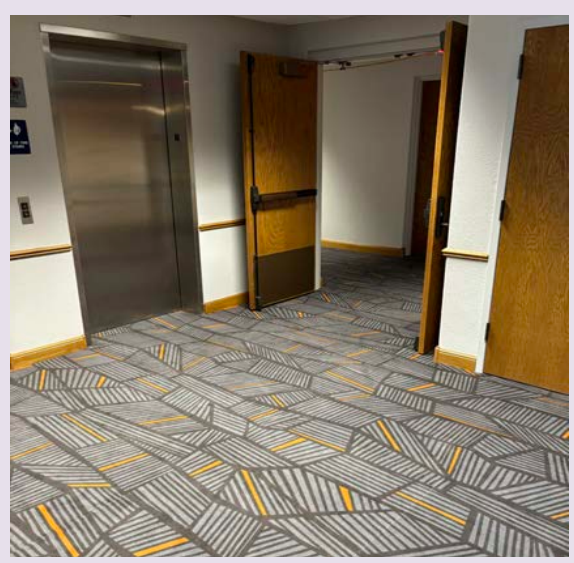
Fresh carpet at Bauer Lodge

Online: glcc.org/give • Phone: (920) 294-7349