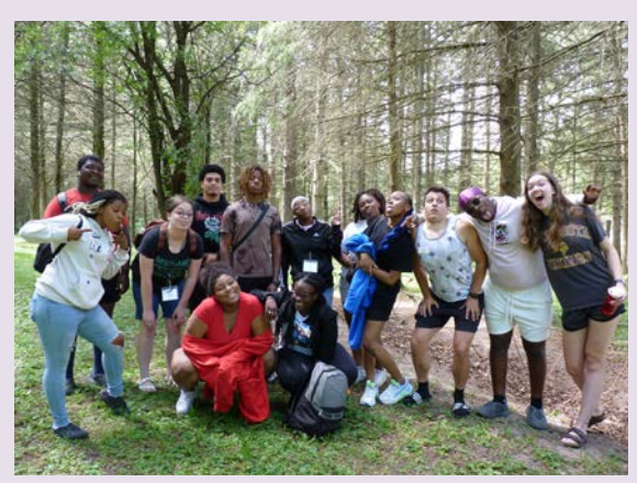
Youth group at Quest