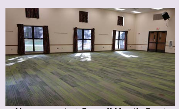
New carpet at Carroll Youth Center