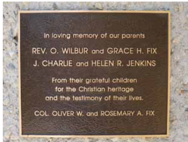
12" x 10" bronze arbor plaque: $5,000