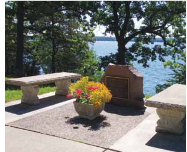
15" x 18" bronze plaque placed on a large patio stone: $15,000