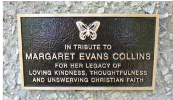
5" x 9" bronze arbor plaque: $2,500